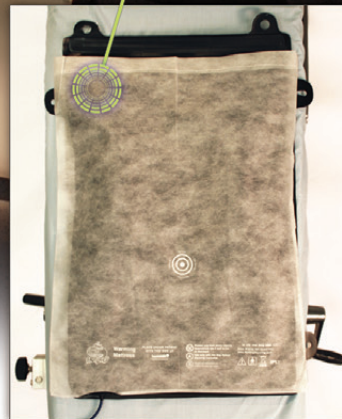
U220: the pediatric underbody warming mattress is designed to maximize safe conduction of heat for the smallest patients.