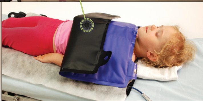
B203: easily adjusted to fit a variety of patient sizes and positions. Simply fold purple/purple while ensuring sensor contacts patient.