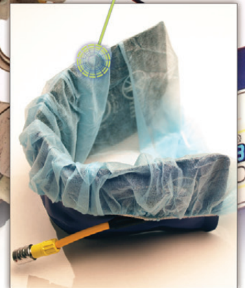
B270/B271: The head warming wraps have formable edges to maintain shape. Disposable hair bonnets are ideal barriers.